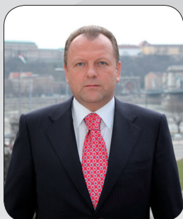
Marius L. VIZER IJF President